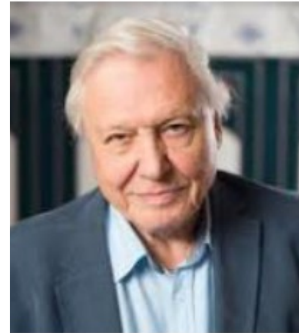
Sir David Attenborough Yellow