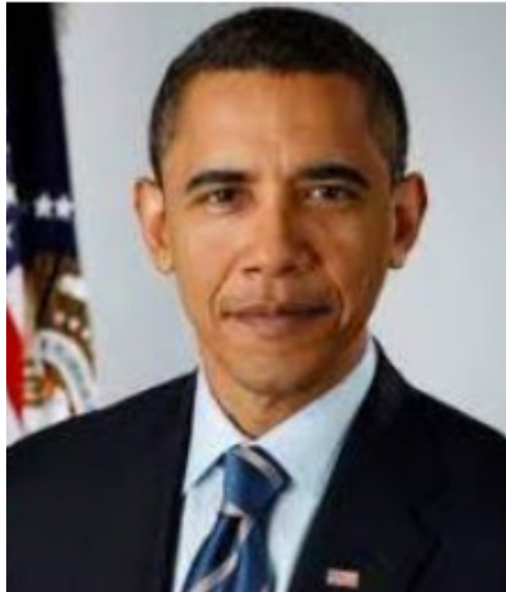
Barack Obama Green