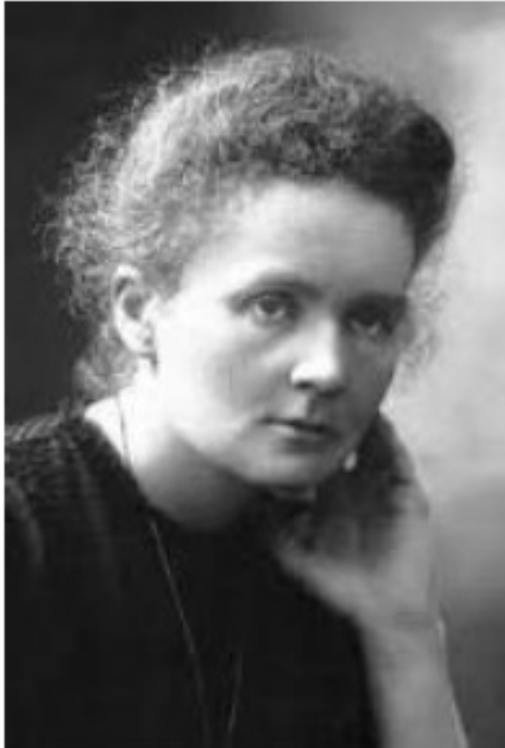
Marie Curie Blue