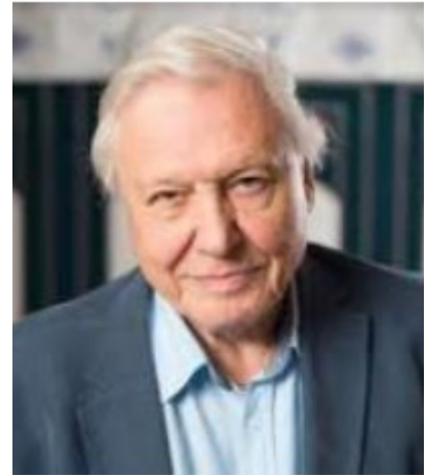
Sir David Attenborough Yellow